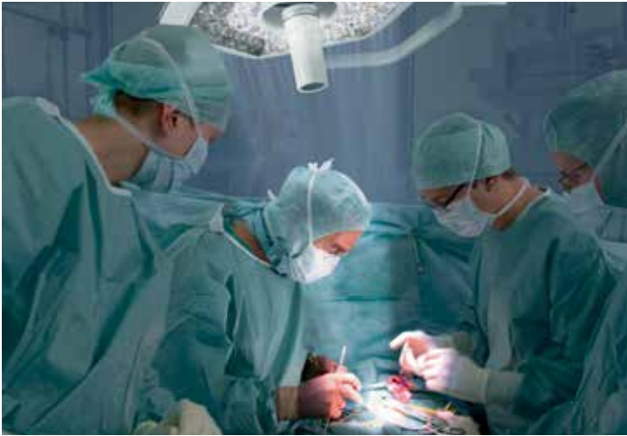
3D sensor technology provides consistent lighting of the surgical site.