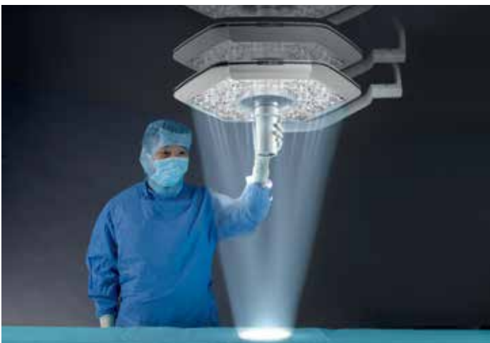
Consistent illumination at typical working distances.