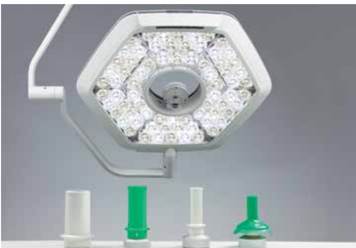
All iLED® 7 Surgical Light's are camera ready — enabling you to upgrade at any time.