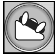
Turn Assist™ Mode Left

Note: Before activating Turn Assist, make sure siderails are in the up and locked position.