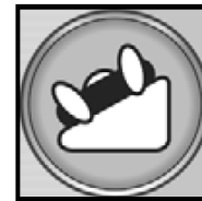
Turn Assist™ Mode Right