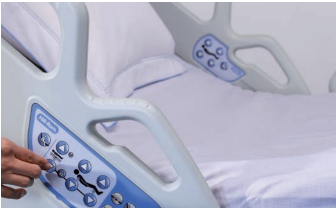
Care grip handles and integrated controls