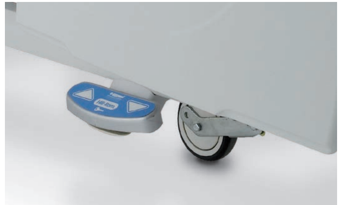
Optional bilateral high-low foot control with automatic lock-out and 5th steering castor