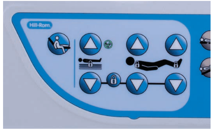
Low height indicator and One-Touch Side Egress positioning