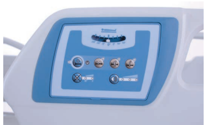
3-Mode Bed Exit Alarm