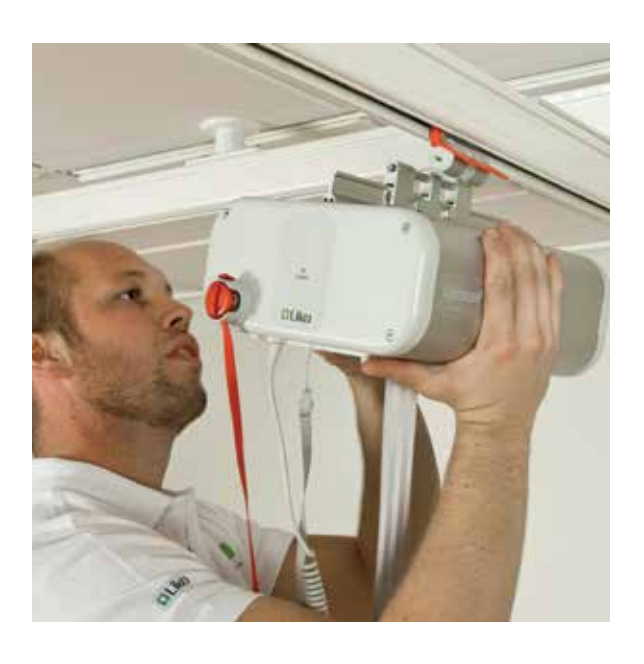
Moving the Lift Motor (excluding LR242 S and LR 242 ES)

The Quick-Release \mathsf{Hook}^\mathsf{TM} Carriage makes it easy to move the system between rooms.