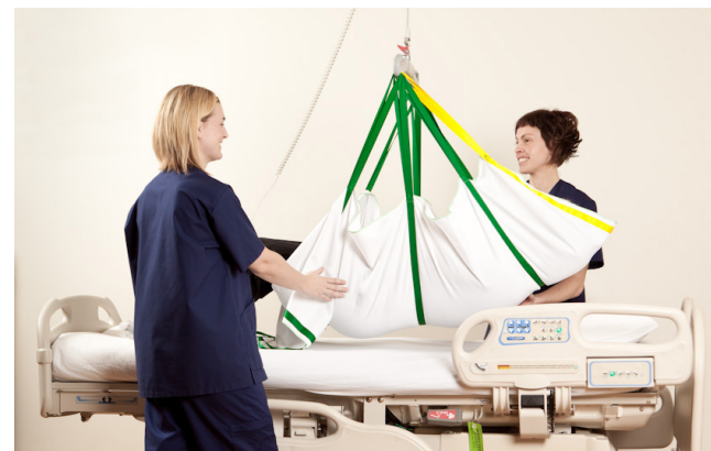
Reposition / turn in bed

What task are you trying to complete with your client?