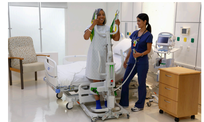
Stand & / or stepping