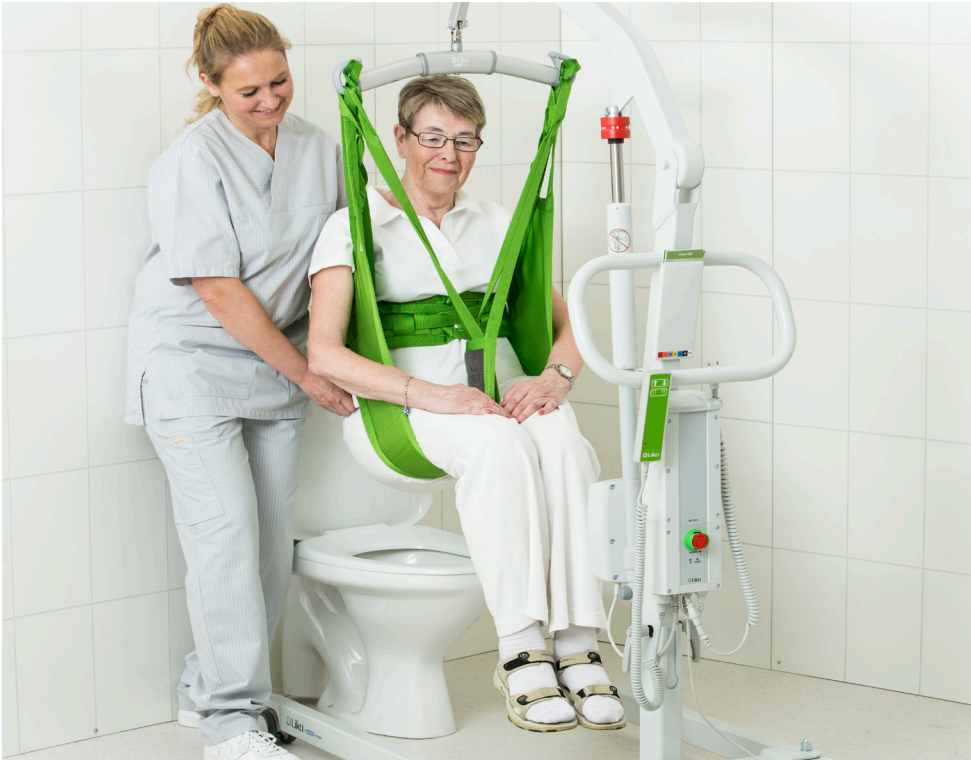
Undressing the client