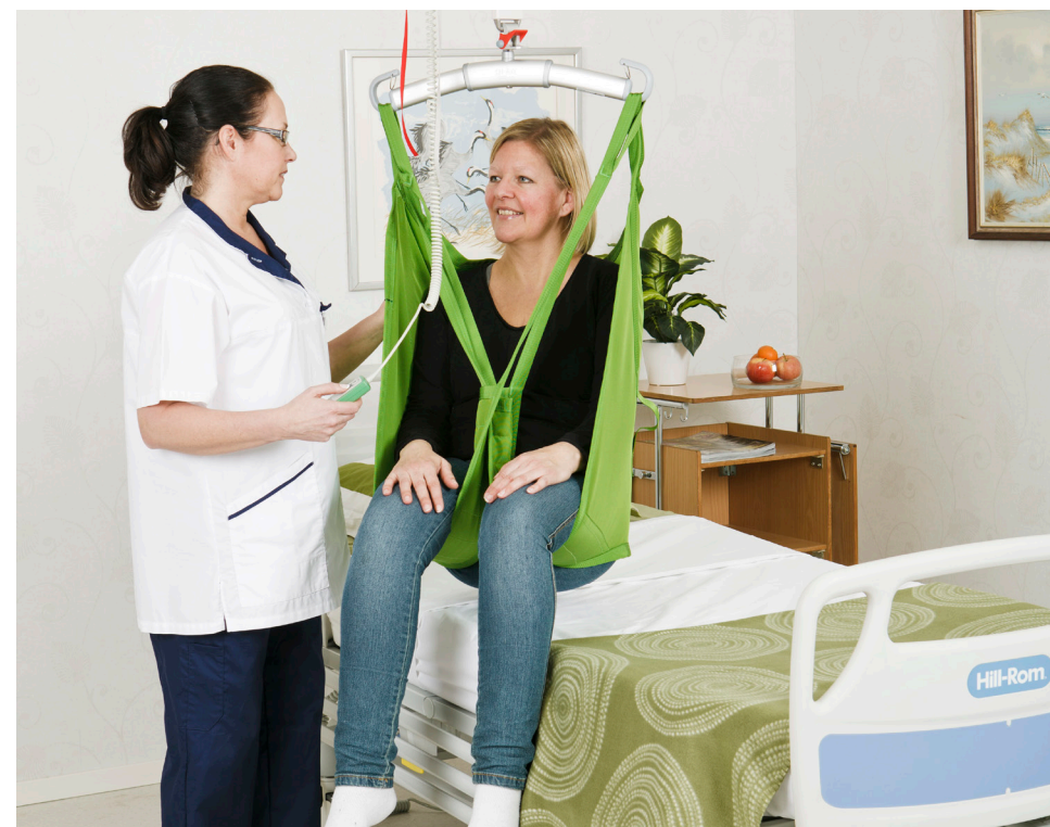
Reduced care package