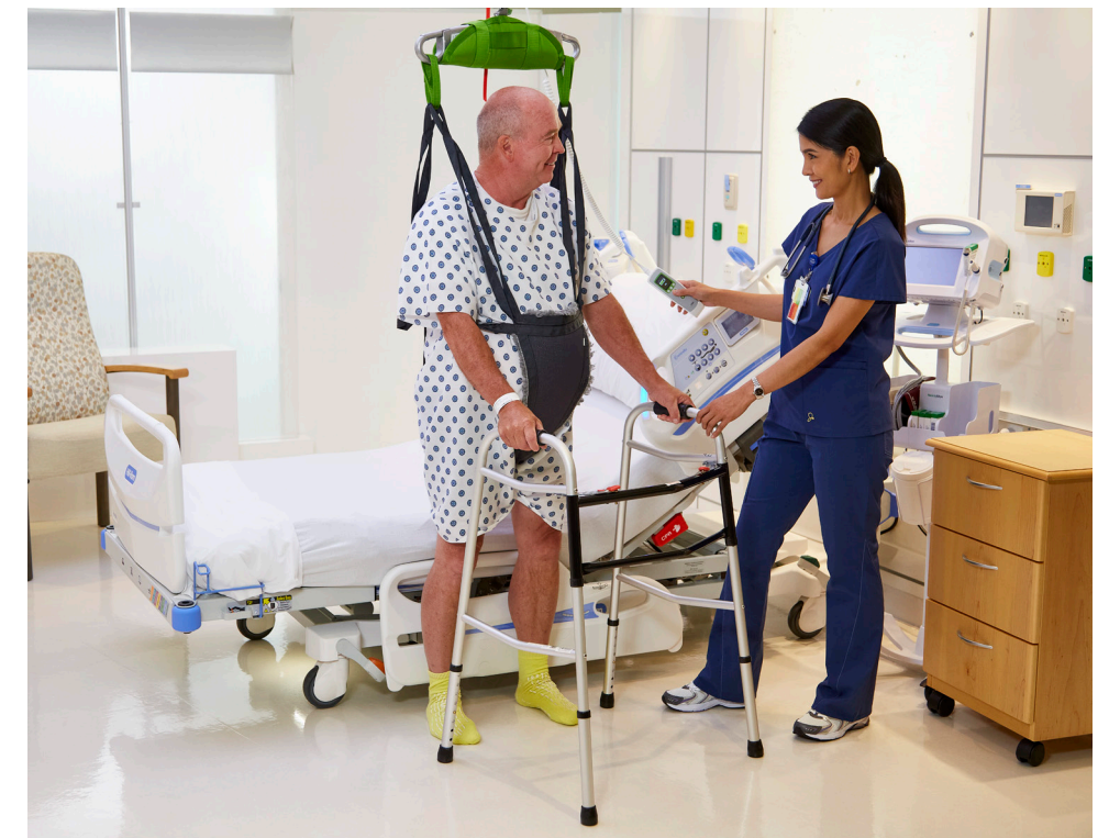
Standing & stepping transfer