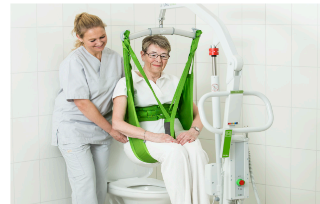
Full lift sitting transfer